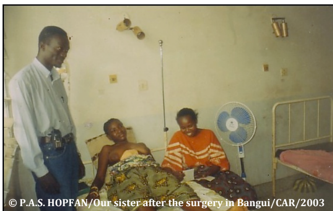
Our sister after the surgery in Bangui/CAR/2003

The Doctor told me that as soon as he would remove the piece of wood, the sister would die. I told him that the contrary would happen and that she would live. The Doctor got angry.