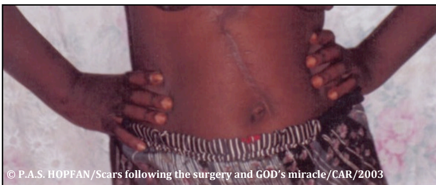
Scars following the surgery and GOD's miracle/CAR/2003

The vision that one of our sisters had received before the fall of the sister was very clear: The person who wanted to fly was the sister who had fallen and who had to die. Those who were holding her represented us in fact, as we were praying and interceding for a miracle from the Lord who, in the end, answered our prayers.