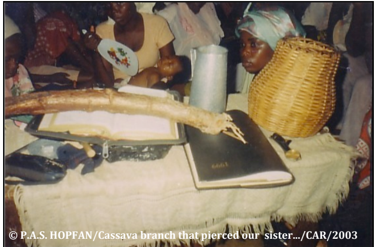
Cassava branch that pierced our sister.../CAR/2003

Some of the brothers who were among us carried her at the foot of the hill, from where we took a taxi to a hospital known as Hôpital Communautaire ("Community Hospital").