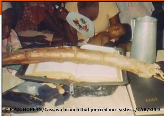
Cassava branch that pierced our sister.../CAR/2003

“The Doctor told me that as soon as he would remove the piece of wood, the sister would die. I told him that the contrary would happen and that she would live... ”